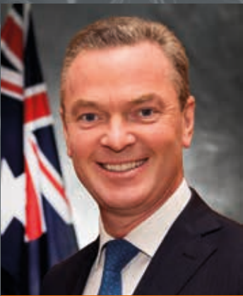
The Hon Christopher Pyne MP Minister for Defence Industry

More than 50 Australian companies have been involved in the Joint Strike Fighter programme which is behind one of the greatest technological leaps in military aircraft that we have ever seen.