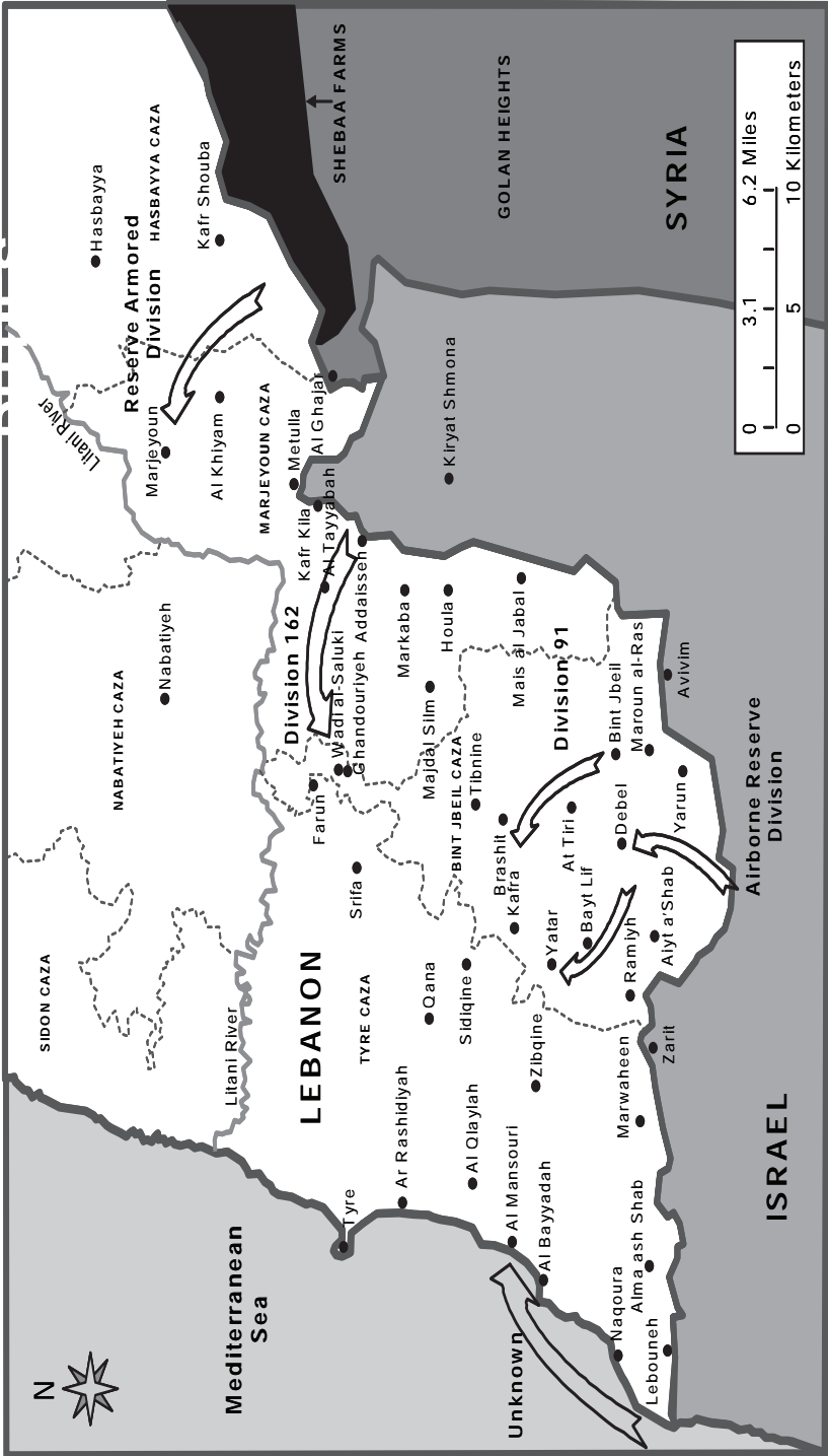
Map 4. Drive to the Litani